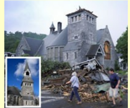
UU Parish of Monson in wake of tornado - with "before image" inset

A tornado sheered off the steeple of the Unitarian Universalist Parish of Monson. Fortunately no one was hurt, but the damage comes at the very end of a major building restoration project. At least one family in each of our congregations in Brookfield and Sturbridge suffered catastrophic damage to their homes, and a staff member of our Springfield congregation also experienced serious property damage.