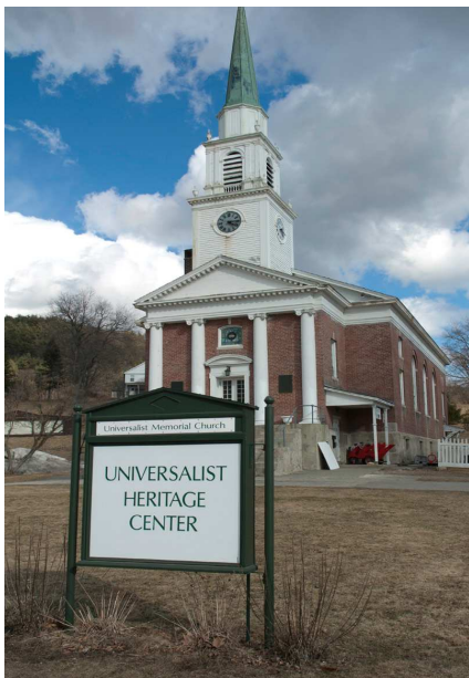
The Universalist Memorial Church in Winchester, New Hampshire

For more information, service times, and past topics, please visit our website at